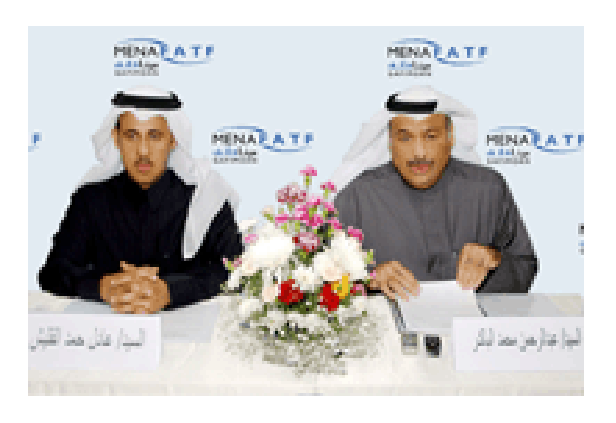
(A Picture of the press conference held in this regard)

In its assertion for the MENAFATF support, the headquarters agreement was ratified and became applicable in 2009 whereby it has been approved by both the Shura Council and the Parliament, and ratified by the King of Bahrain; he has issued as well law No. (5)/2009 to ratify the agreement on March 26, 2009 and was published in the official gazette on April 2, 2009.