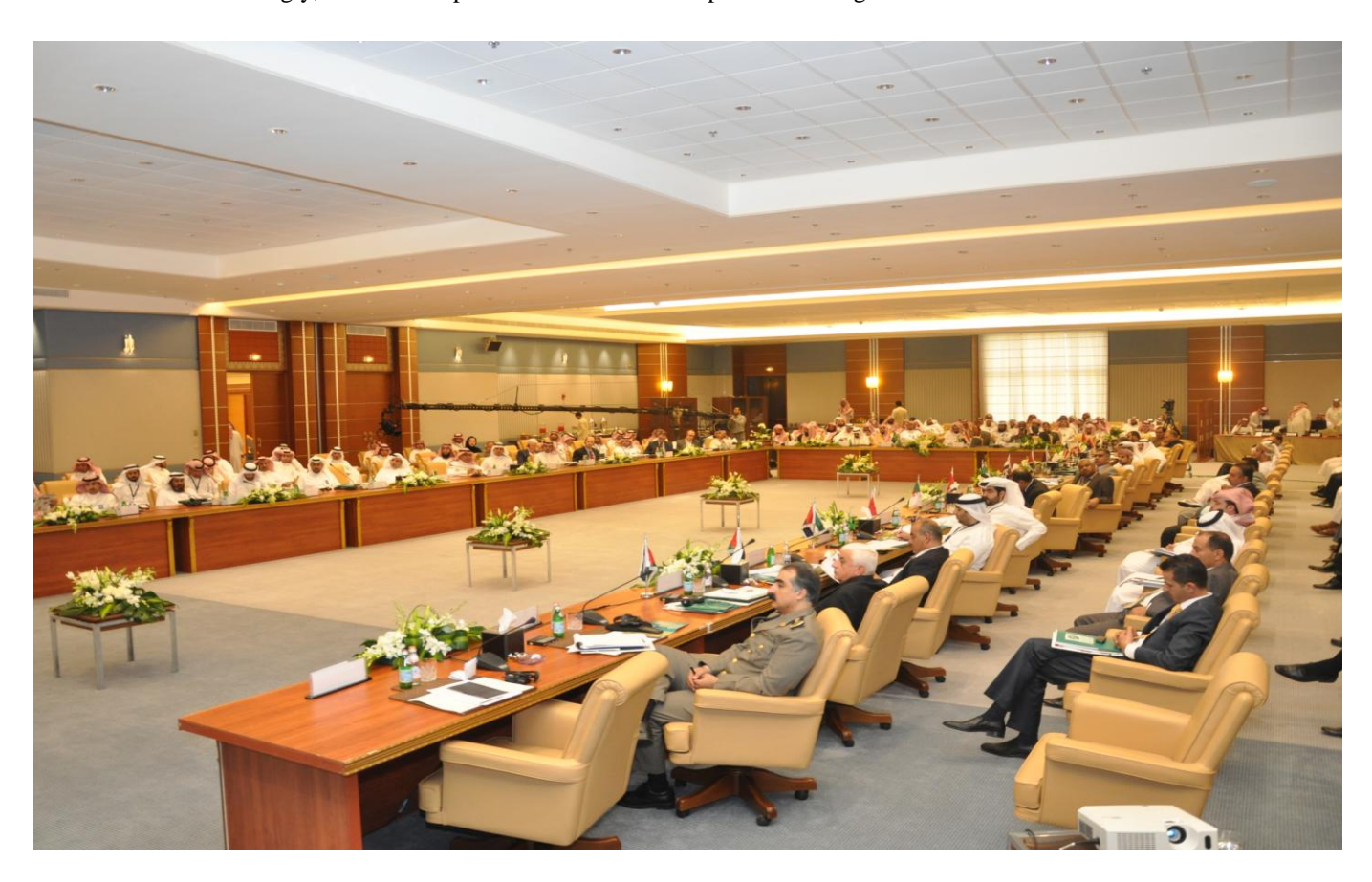
AML/CFT and other financial and non financial institutions and coordinate combined efforts, urge member countries to seek effective application of the international standards in combating the offences of money laundering and terrorism financing and give more importance to the related statistics on both crimes for benefit purposes.

among MENA countries on seminar related topics. At the end of the seminar, the following recommendations were issued among others: encourage countries to establish the adequate mechanisms to deal with seizures suspected of being connected to ML/TF offenses, urge public prosecution, judiciary to assign investigators and public prosecutors to deal with ML/TF cases and train them accordingly, stress the importance of effective cooperation among national local authorities concerned with