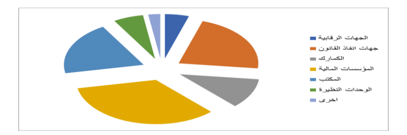
Suspicious or suspected cases according to the actions taken/2016