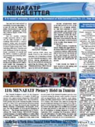
(The first issue, December 2010)

In this framework, the MENAFATF started issuing the newsletter in 2010: the 1st issue was issued in June 2010 covering the period from January to June 2010; the 2nd issue was issued in December 2010 covering the period from July to December 2010.