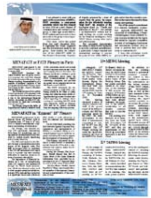
(The second issue, December 2010)